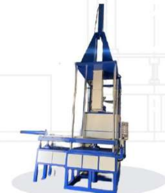
(1.4) 30KG Injection Transfer Moulding Machine