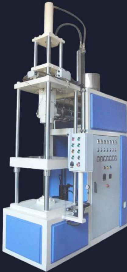
(1.1) 4KG Injection Transfer Moulding Machine