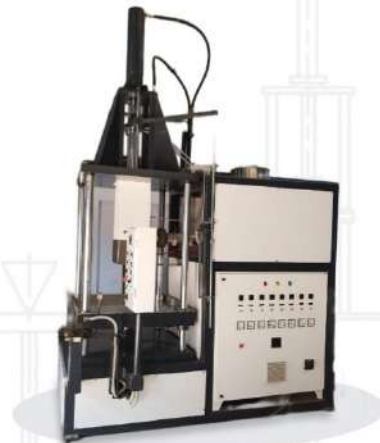
(1.3) 20KG Injection Transfer Moulding Machine