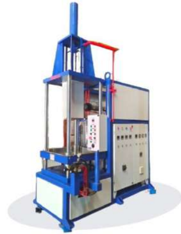
(1.2) 10KG Injection Transfer Moulding Machine